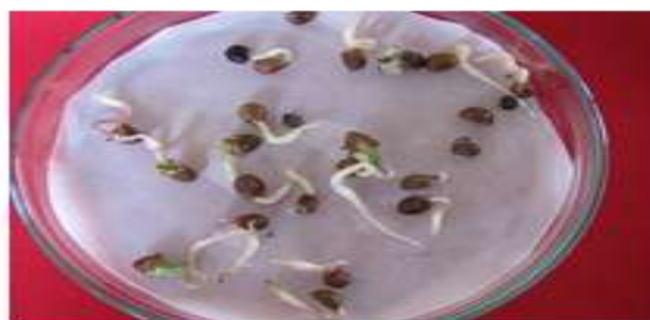
Figure. 3. Germination of acid treated seeds in petri plate

Means with atleast one letter common are not statistically significant using Fisher's Least Significant Difference