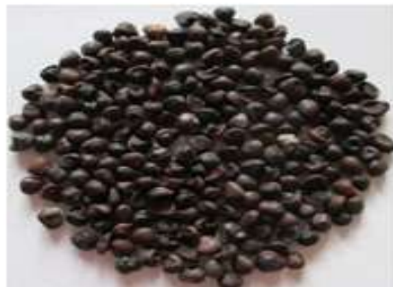
Figure. 2. Sweet potato seeds