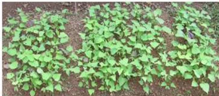
Figure. 4. Seedlings in the nursery

Immersion of seeds in highest conc. sulphuric acid for longer time (more than 30 min) disrupts the seed coat [13]. The fact that seeds treated with Conc. acid for 10 minutes gave the highest percentage of germination and within the shortest period as compared to 5 and 15 minutes respectively, indicate that the more rapidly the seed coat is ruptured the faster the rate of germination, however, prolonged emersion may be injurious to the seeds as the acid may rapture vital parts of the embryo.